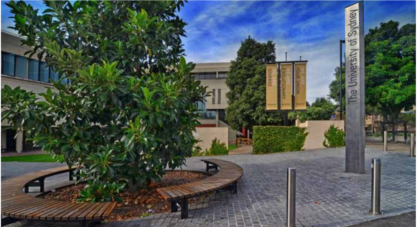
City Road Frontage

The University of Sydney engaged Sturt Noble Associates to design and document a $500,000 upgrade to an existing outdoor courtyard and the City Road frontage.