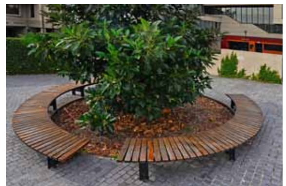
Custom circular bench

Planting, walls and level changes are used to form and divide spaces, creating discrete and separate areas within the courtyard.